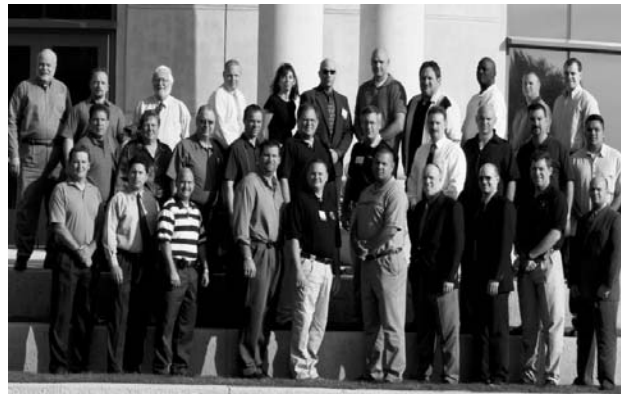
Group photo of Ethics Train-the-Trainer held May 8-12, 2006 in Plano, Texas.

POLICING THE POLICE... continued from page 4